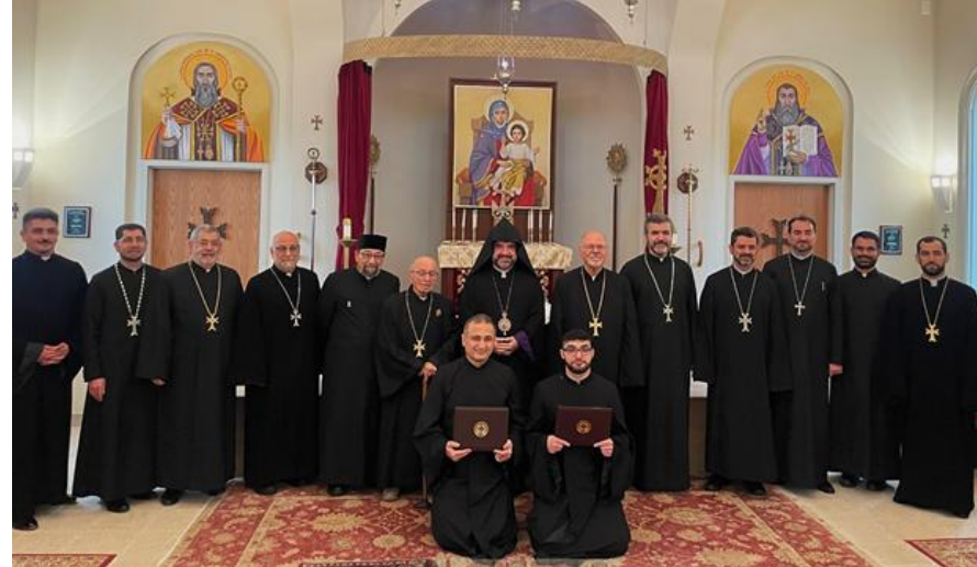
Clergy attending St. Nersess graduation ceremony.