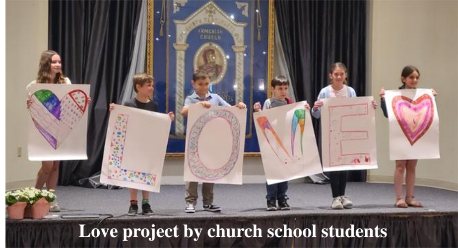
Love project by church school students