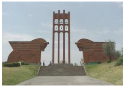
Sartarabad Memorial in Armenia