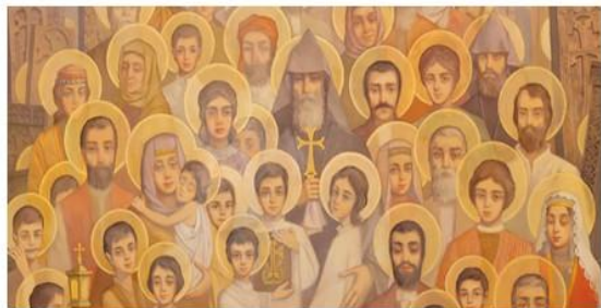
Icon of the Holy Martyrs of the Armenian Genocide canonized in the Armenian Church, April 2015

Saints Vartanantz Armenian Church 180 Old Westford Rd., Chelmsford, MA